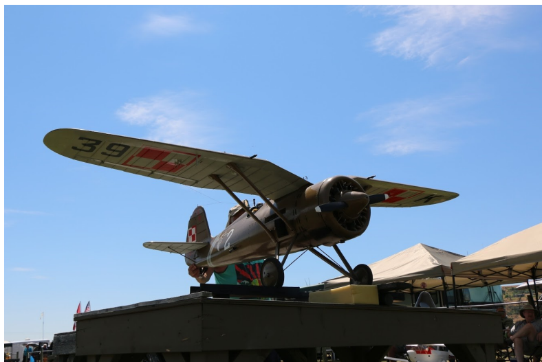
Polish WWII Fighter PZL P11c